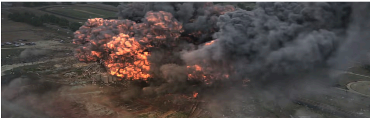
Photo Credit: Chemical Safety Board “Dangerously Close: Explosion in West, Texas”

were chemically contaminated . Many evacuees paid out of pocket to stay at hotels, a steep burden for low-income residents. The total financial cost to the community and local economy is not yet known.