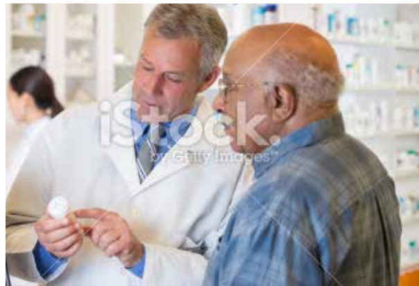
Under Medigap reform, seniors' premium costs would fall substantially.

This package of proposals represents a true “win-win:” Current seniors would save on their health expenses, while seniors-to-be would have greater confidence that the promises made to them can be kept when they prepare to join Medicare themselves.