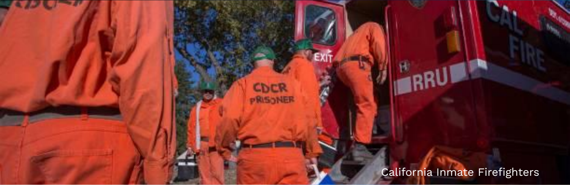
California Inmate Firefighters