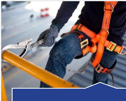
Fall Protection – General Requirements (1926.501)