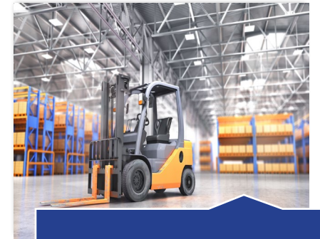
Powered Industrial Trucks (1910.178)