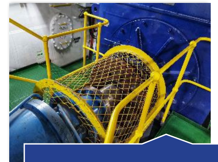
Machine Guarding (1910.212)