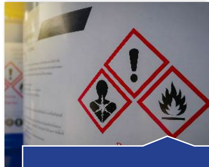
Hazard Communication (1910.1200)