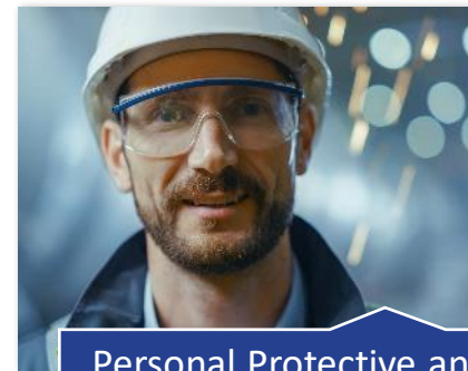
Personal Protective and Lifesaving Equipment – Eye and Face Protection (1926.102)