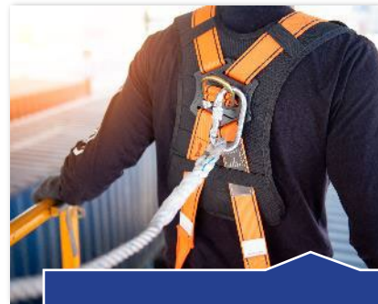
Fall Protection – Training Requirements (1926.503)