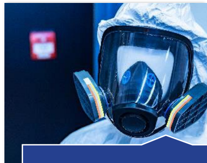
Respiratory Protection (1910.134)